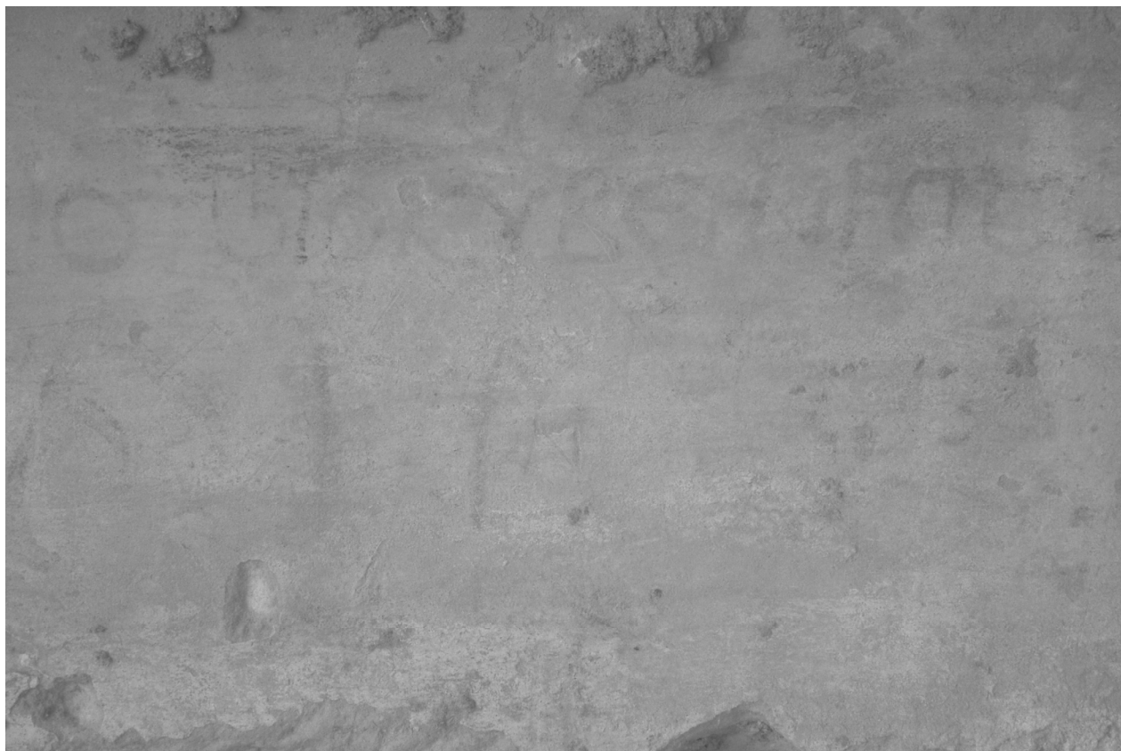
Plate 5: Graffito from temple area at Amheida, inv. 3053, infrared photo, center.