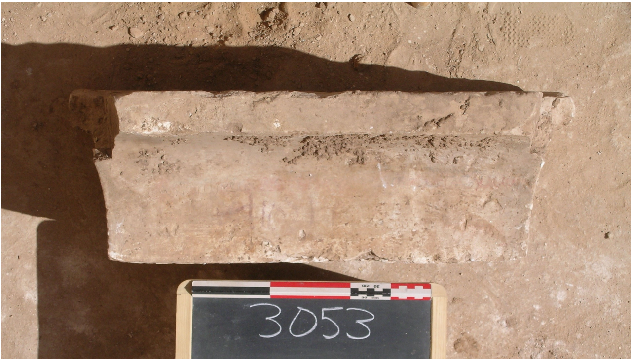
Plate 3: Graffito from temple area at Amheida, inv. 3053.