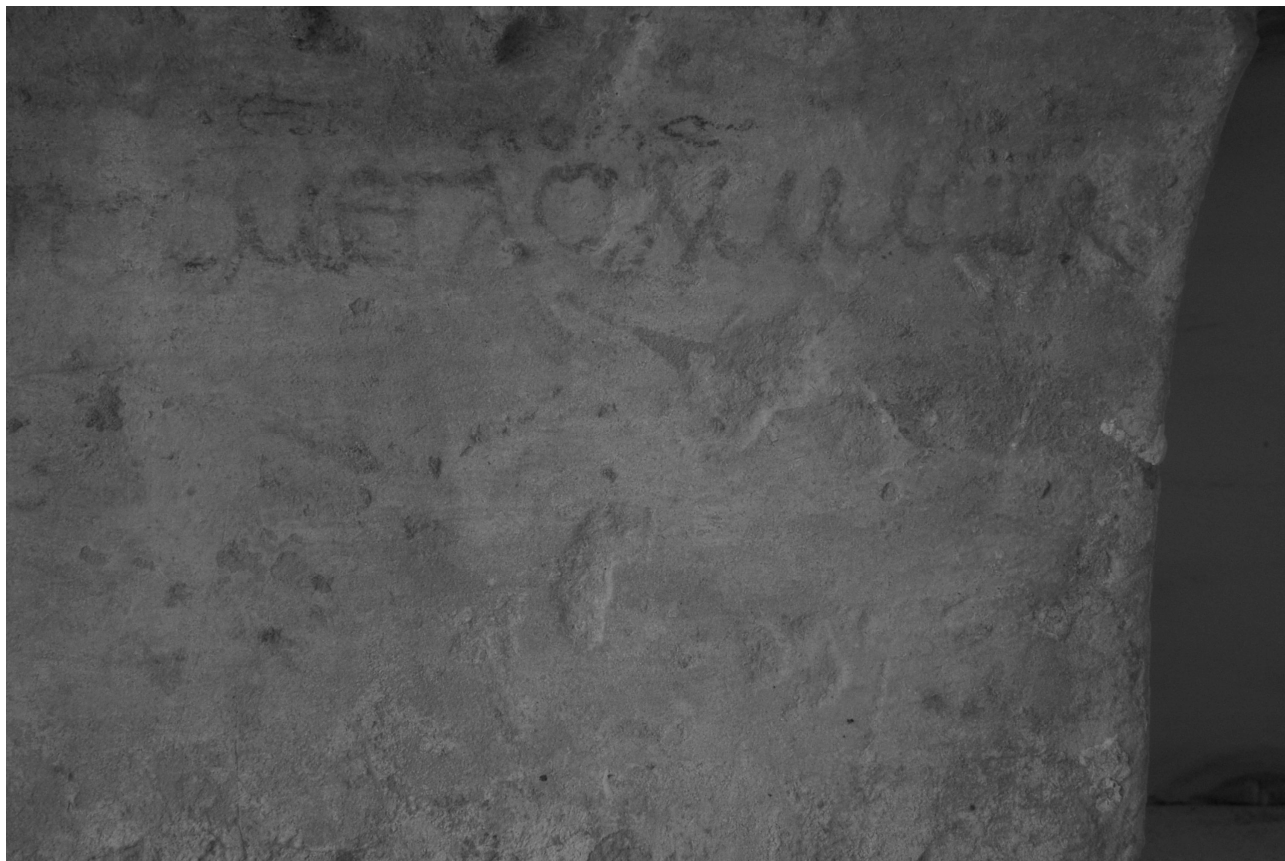
Plate 6: Graffito from temple area at Amheida, inv. 3053, infrared photo, right.