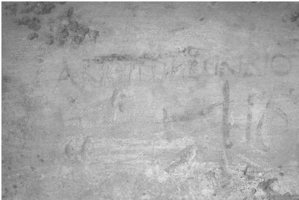
Plate 4: Graffito from temple area at Amheida, inv. 3053, infrared photo, left.