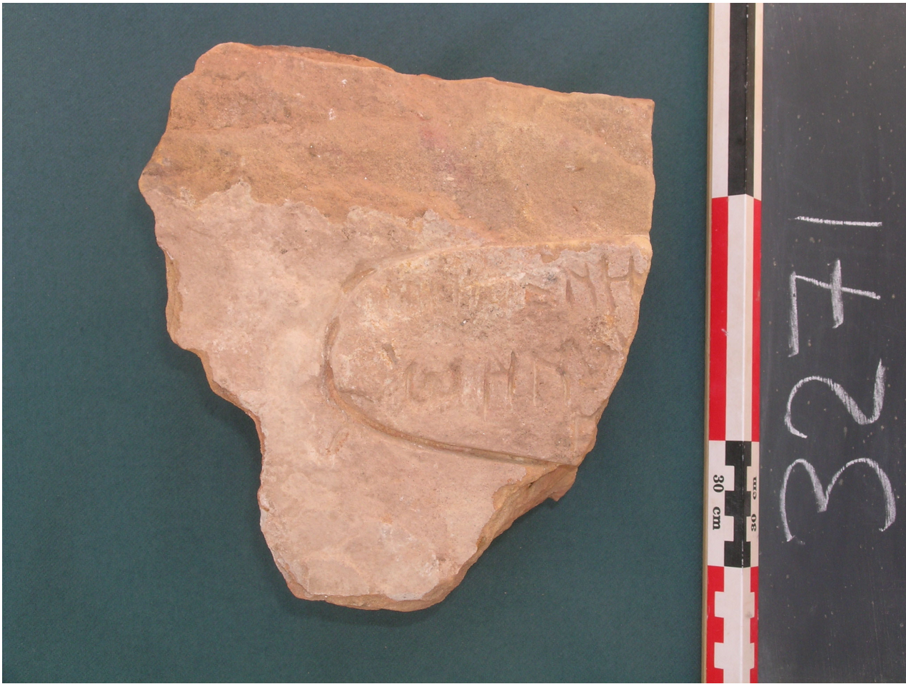
Plate 2: Graffito of Horigenes, Amheida inv. 3271.