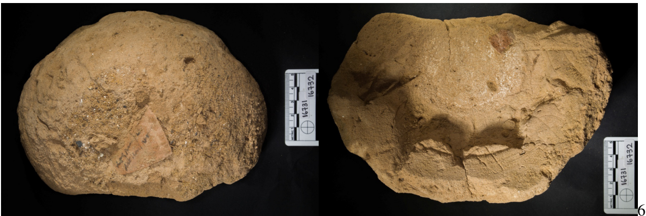
Fig. 6: unfired clay stopper inv. num. 16732, type CC. On top, ostrakon inv. 16731 is embedded (left). The inner part is concave. Rim, neck and shoulder impression of the jar is visible as well as vine leaf impressions.

The upper part of both the types of stoppers is generally convex with semicircular section, in some cases flattened in the middle part where the ostrakon is placed.