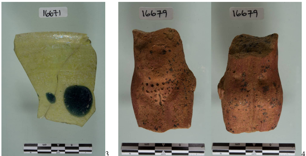
Fig. 3: fragment of a glass lamp decorated with blue dull glass dots and incised lines (4 th century A.D.).

In DSU 254, mud brick debris in pit F159, just below surface DSU 251, the torso of a pottery statuette was found (inv. 16679 , fig. 4 ), well outlined with anatomical details, like the abdomen protruding outwards indicating pregnancy, the navel represented with a small cavity on the abdomen, the pubic triangle with pubic hair, the vulva and the glutei. The female figure is standing with joined legs, which are only partially preserved. Remains of the five fingers of the left hand are visible on the hip, while the right hand was probably bent below the breasts. Similar objects, even if not identical, were unearthed in Balat and are dated to the Second Intermediate Period/XVIII dynasty (S. Marchand, G. Soukiassian, "Balat VIII," Le Caire, 2010).