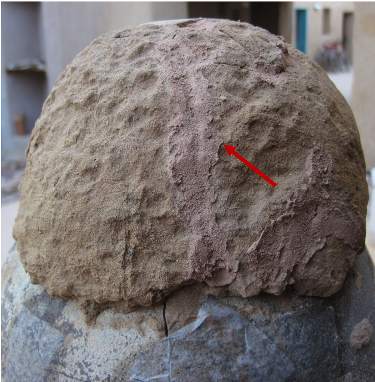
Fig. 7: unfired clay stopper inv. 16895, sealing jar inv. 30189. The impressions are potentially caused by hail or rain droplets. The arrow indicate the cracks filled in with a moisture made of a powder and water, reddish-brown in color.

the stoppers used to seal the vessels are made with different materials. We may argue that gypsum stoppers sealed only kegs and unfired clay stoppers only jars.