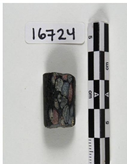
Fig. 1: bracelet with coils of white dull glass, forming a crossing-wave pattern (inv. 16722 ). Fig. 2: bracelet with colored glass inlays (inv. 16724 ).