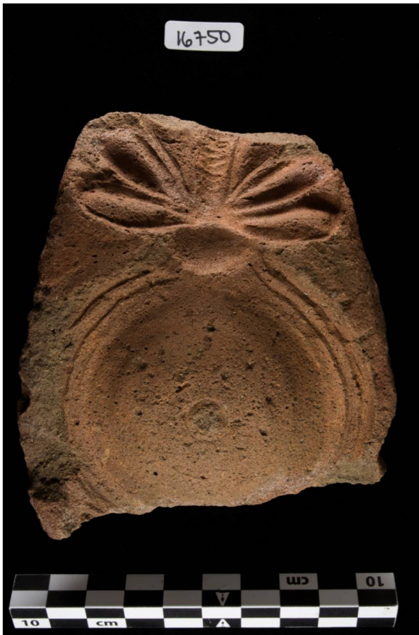
Fig. 8: valve of a lamp mould, inv. num. 16750.

central stalk, decorated probably with nine parallel grooves. In Amheida lamps made with this kind of mould have not yet been found so far. Moreover, parallels for this type of lamp are not yet identified.