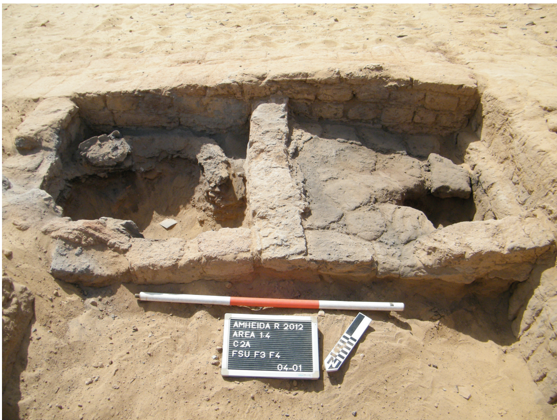
Figure 4: Bread oven and platform (excavated in 2012)