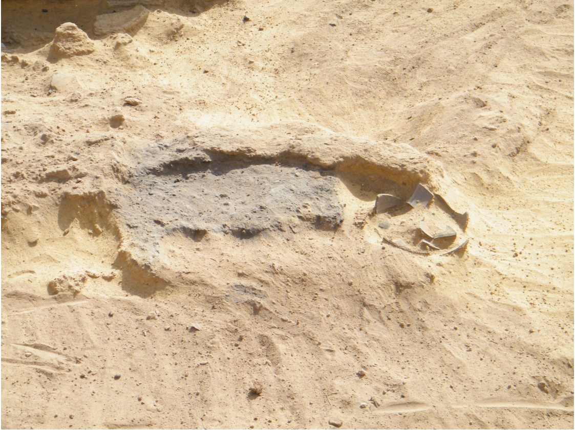
Figure 5: Partial hearth in 2012 trench 1