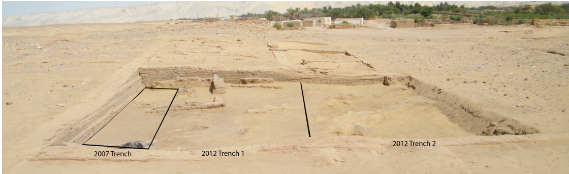
Figure 3: Area 1.4 fully exposed prior to sondages and with trenches indicated