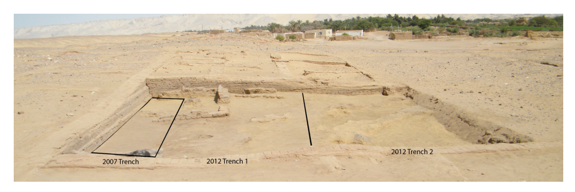
Figure 3: Area 1.4 fully exposed prior to sondages and with trenches indicated