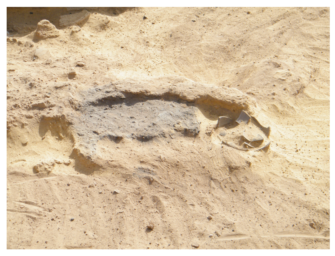
Figure 5: Partial hearth in 2012 trench 1