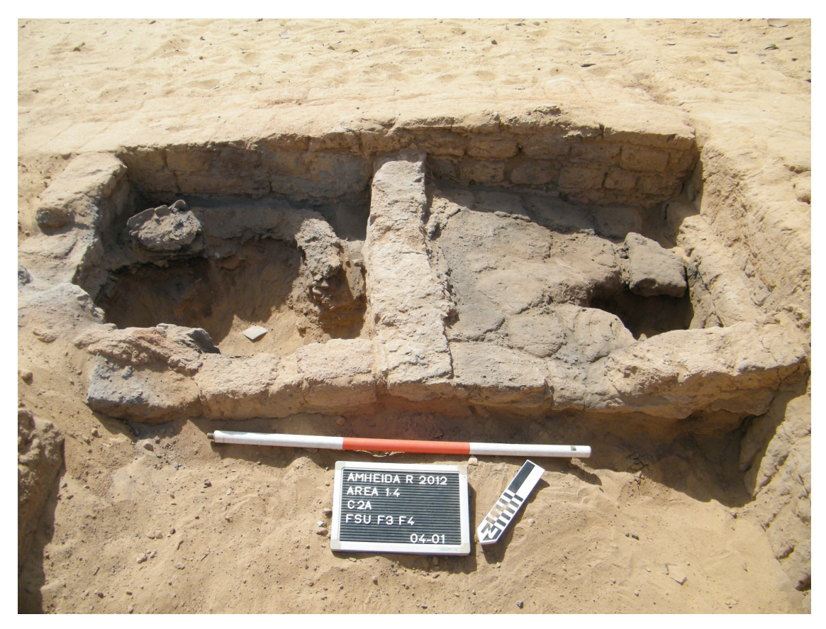
Figure 4: Bread oven and platform (excavated in 2012)