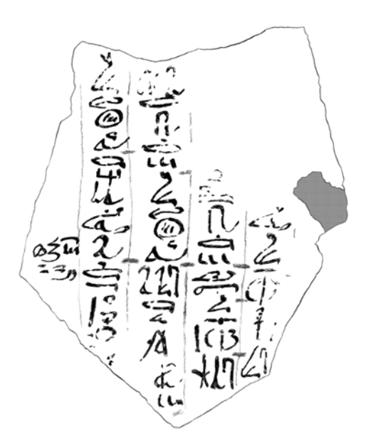
FIG. 2. Facsimile drawing.