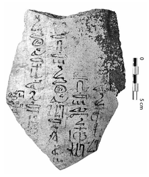
FIG. 1. Photograph of the Amheida ostracon.<sup>7</sup>