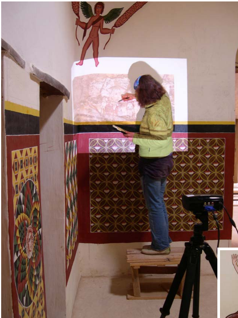
Projecting and tracing a figurative scene (Pereus and Andromeda).