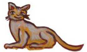
Detail: cat from the west wall (see the scene of a couple playing a board game overhead).

The ‘new Villa’, designed and built by architect Nicholas Warner, was finished in 2009 and during the 2010 field season the decorators could move in. They started with the Red and the Green Room, simply because most of the decoration is still in situ and the missing parts were fairly easy to reconstruct. After completing these two rooms, work started on the surviving geometric registers from the Central Room. These could be finished in 2012 and the painters moved on to the huge dome, which must have been completely decorated as well. Since the dome of the original villa entirely collapsed not one fragment of the decoration is still in place. Even worse, large parts of the walls are smashed and of the dome there are only smithereens left. Even so, closely based on these remaining fragments a very probable solution for the decoration of the dome could be made by my colleague Martin Hense and me. Subsequently, the decoration was applied to the dome in only four weeks time by no more than two