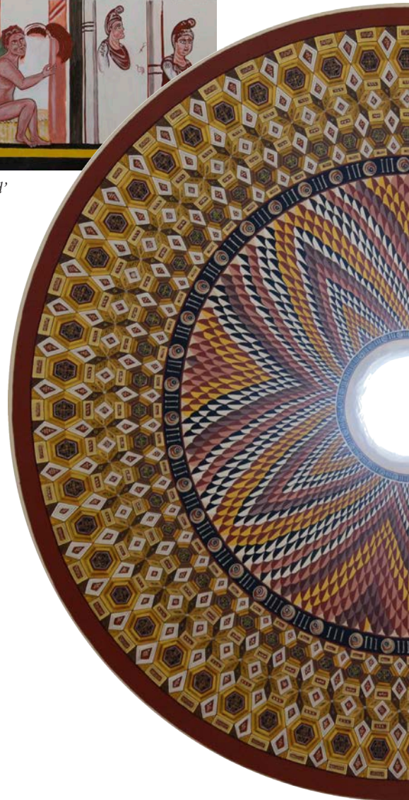
The finished reconstructed decoration of the dome.