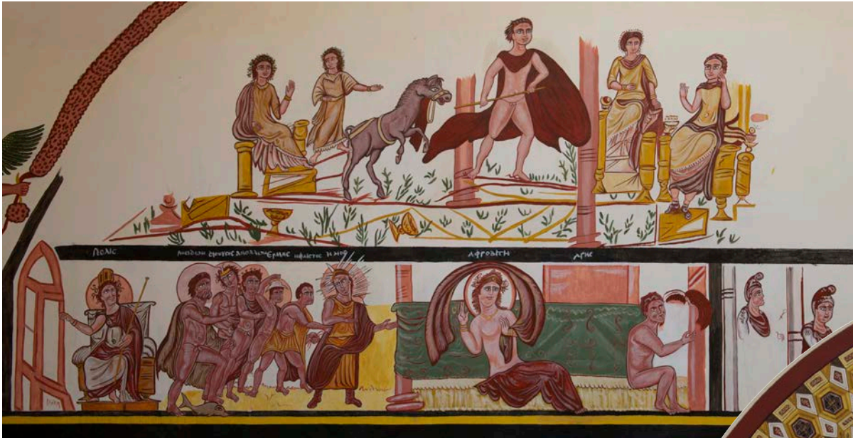
In the lower register, Polis and running gods, headed towards Aphrodite and Ares to catch them 'red-handed' in a compromising situation... On the right, two men wearing Phrygian caps (guards?). In the upper register, more gods or heroes on thrones, a horse and two golden cups (meaning unclear).