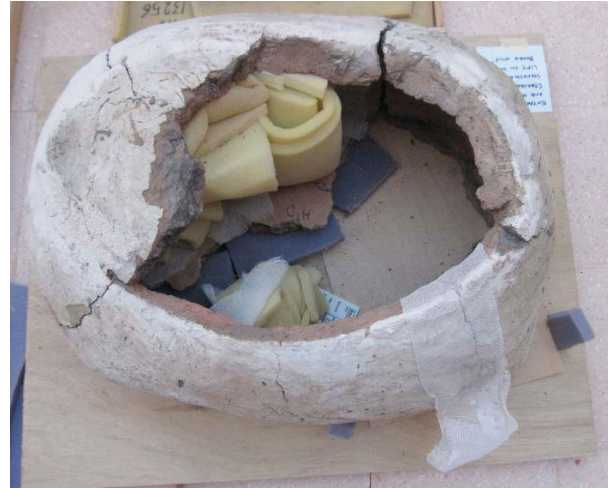
Detail of the body of the coffin, after removing packing tape, before treatment, January 2011.