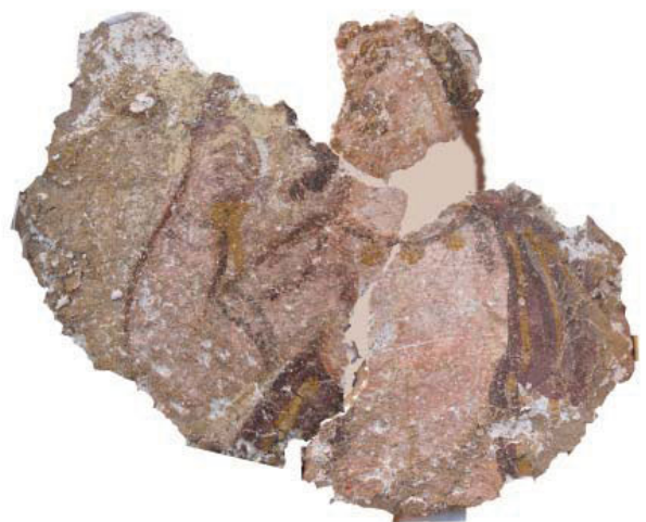
An attempt at digital reconstruction of figure, with digital “flesh-toned” fill and “continuation” of hair curls to show potential use of Photoshop for fuller reconstruction of painted scenes in Room 1.