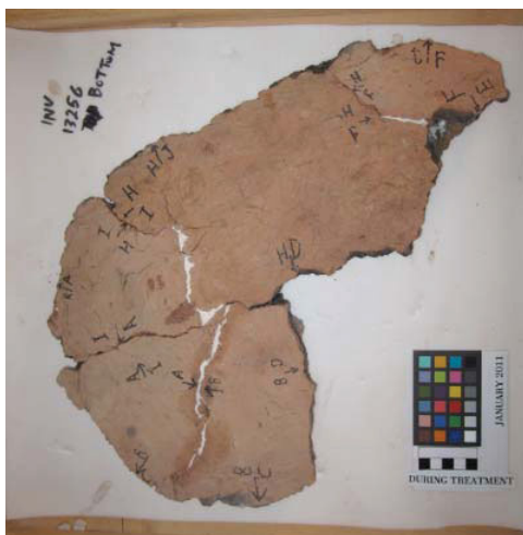
The coffin base, after reassembly and during filling with 3M microballoons and Acryloid B72, top view.