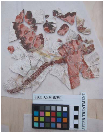
Detail, re-adhered sections of the PR arm holding garland