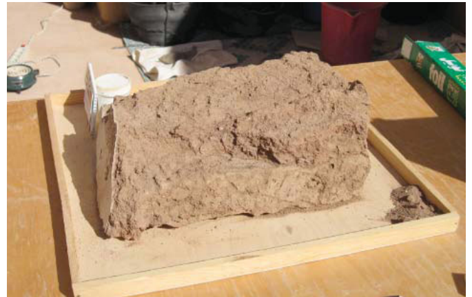
Garland fragment, prior to detachment, top view, 2010