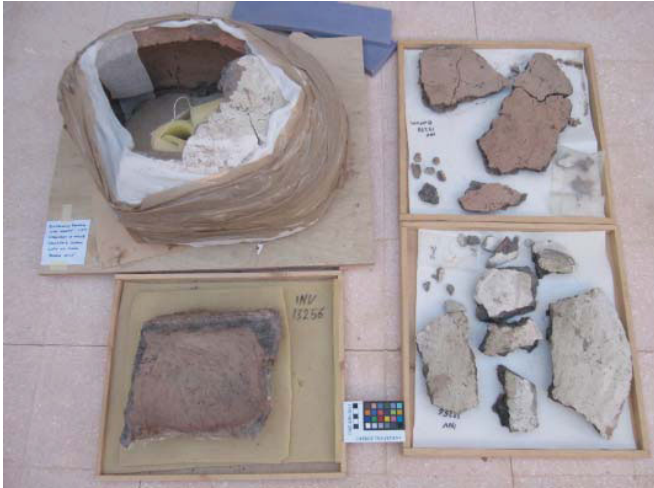
The coffin before treatment, showing numerous fragments, January 2011.