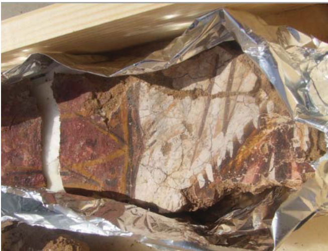
Example of “lyre player” fragment from one of three trays of plaster contaminated with mold

Mold growth was identified on fragments in three trays [Trays 135, 136 and 137] in the 2010 season. The mold appeared to be growing on the consolidants previously applied to the surfaces of these fragments. This season, cotton swabs dampened with ethanol were gently rolled over the moldy areas to kill the biological growth while ensuring that the paint layers were not damaged. Generally, at least two passes with swabs were required to clean the mold. The fragments were then left to air dry in sunlight and checked regularly for the efficacy of the treatment. These trays should be re-examined again in future seasons to ensure that there is no re-growth of the mold.