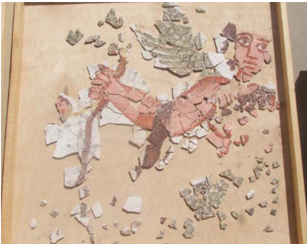
Top of Putto, before fragments were adhered together, Jan. 2011

The fragments were attached on the front face using tiny pieces of feathered kozo Japanese paper brushed with 3-15% Acryloid B72 in acetone. The lowest concentration of B72 required for attachment was used (usually 5%), but higher concentrations were sometimes necessary for larger or coarser fragments. Despite the use of a very dilute adhesive which generally did not stain the painted surfaces, the pink and red pigments were extremely sensitive and tended to darken. Some fragments were so deteriorated that they required both Japanese tissue bandages on the front and as well as backings. During the course of the reconstruction, it became clear that the fragments were in extremely poor condition and the attachment of fragments together, even using Japanese paper and Acryloid B72, was placing additional stress on them. Even after nearly two full days of reconstruction work, the entire figure could not be reassembled because significant portions of the painted putto were either lost or deteriorated. The larger reconstructed sections were placed in trays for storage along with printed digital images of our attempts at overall reconstruction.