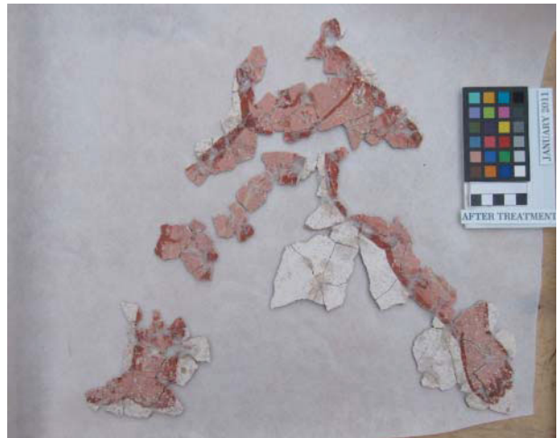
Detail, re-adhered sections of torso and legs