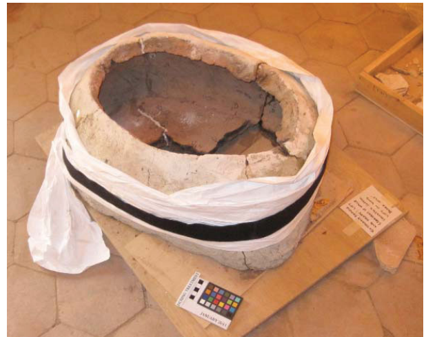
The body of the coffin, after gluing and while supported with a double-sided Velcro strap during the setting of the adhesive.