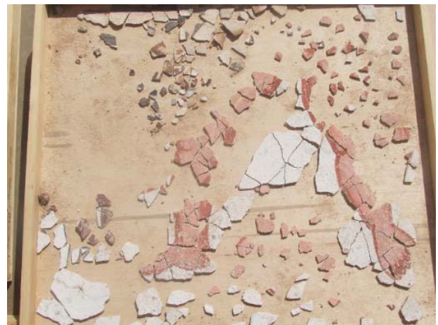
Lower section of Putto, before fragments were adhered together, Jan. 2011