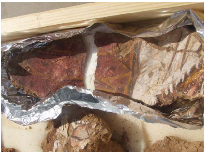
Same fragment after cleaning with ethanol