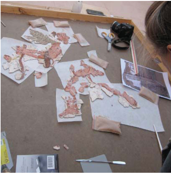
Detail, during reconstruction