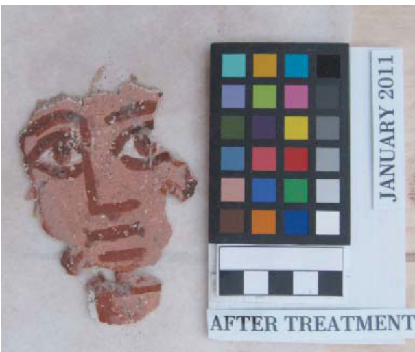
Detail, re-adhered sections of the face