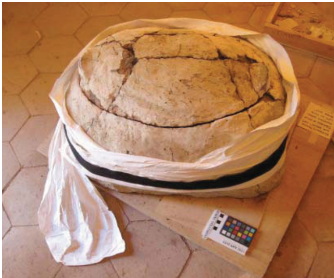
The reassembled coffin, during setting of the adhesive.