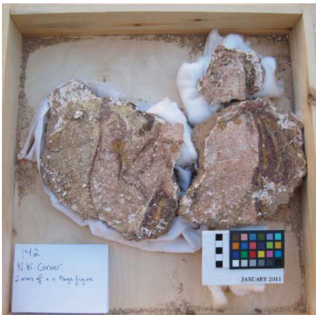
Fragments post-cleaning in 2011, with image somewhat more visible