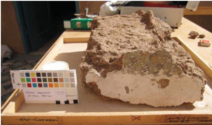
Garland fragment, prior to detachment, front view, 2010

This season, we re-examined the painted area of the detached fragment; the cyclododecane had nearly entirely sublimated, leaving the original painted surface intact and visible. The B72 consolidation was also successful, making this decorated section reasonable for basic handling. Thus, this approach would be appropriate in specific cases where painted mudbrick blocks are too large or unstable to be stored in their entirety. However, we must caution against indiscriminate use of this technique as it involves the destruction of original ancient material.