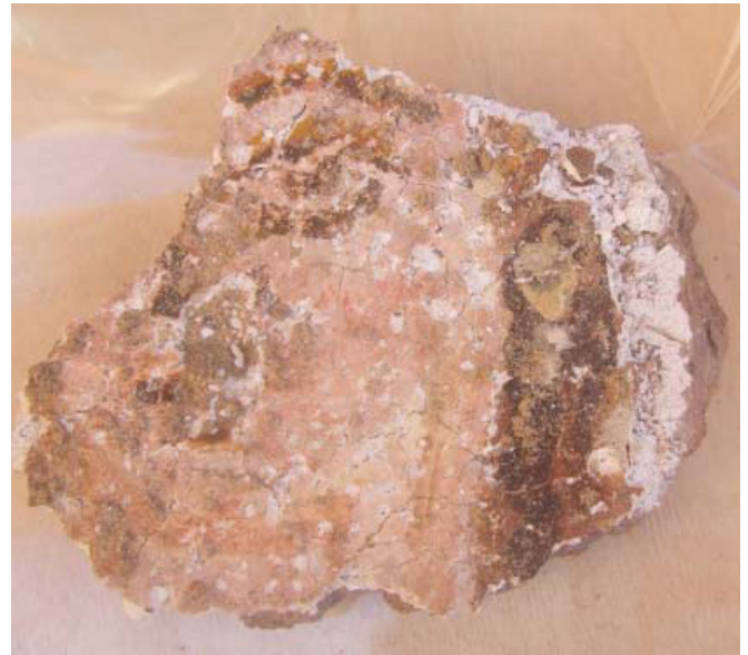
Detail of face fragment showing extent of paint loss due to salt problems, and attachment of dirt to the fragment due to consolidation attempts prior to 2010-2011