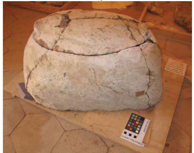
The reassembled coffin, after treatment, Jan. 2011