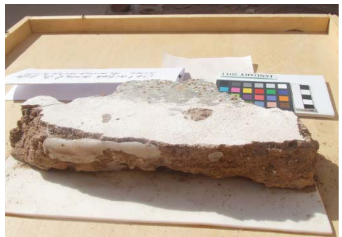
Detached decorated section of garland fragment, side view. Some remaining cyclododecane still visible along edge (white "wax-like" crystals), 2011.