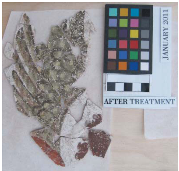
Detail, re-adhered section of the PR wing and hair curls on the PR side of the face