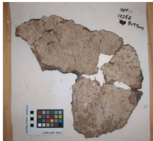
The coffin base, after reassembly and during filling with 3M microballoons and Acryloid B72, view of the underside.