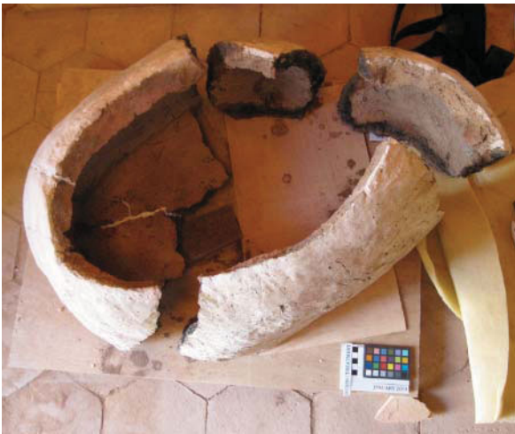
During consolidation of the edges of the body fragments. The ceramic fabric on the edges darkened with the application of Acryloid B72.