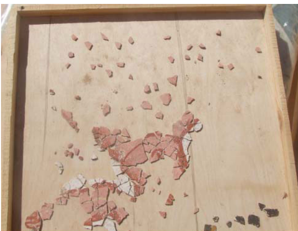
Mid-section of Putto, before fragments were adhered together. Jan. 2011