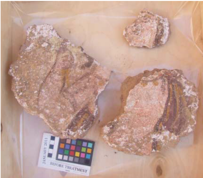
Condition of fragments related to female figure, prior to cleaning in 2011

As an alternative to physical reconstruction, conservation stabilization in combination with digital reconstruction offers new possibilities for understanding the original painted decoration in Room 1. In the case of three fragments of a female figure from the northwest corner of Room 1, the salt-laden and dirty fragments were first cleaned with soft brushes, wooden tools and swabs barely dampened in ethanol to clarify the image as possible. The fragments were so structurally unstable that moving them identify their original locations. Therefore, photographs were taken of each fragment and manipulated in Photoshop; flesh-tone colored “fills” and digital “hair curls” could also be added to missing sections between fragments to simulate the original figure.