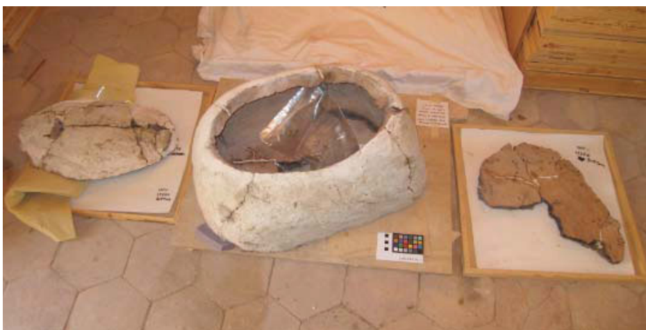
The lid, body and base of the coffin, as stored in Jan. 2011.