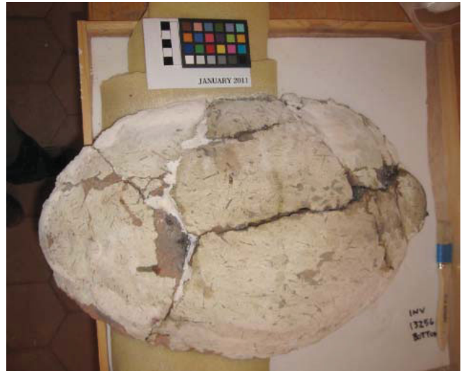
The lid after re-assembly and during filling of gaps with microballoons and Acryloid B72.