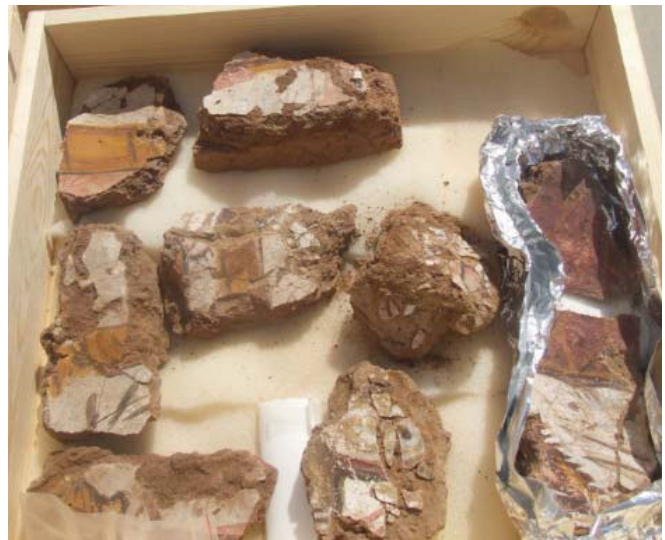
Overall view of one of the three trays after cleaning with ethanol and air/sun drying