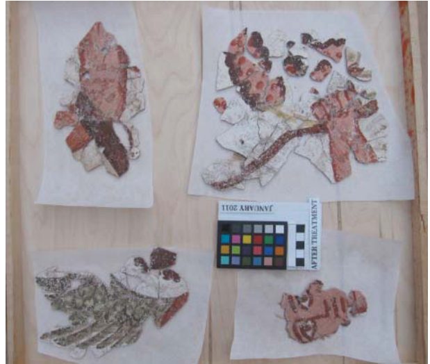
(Clockwise from upper right: The PR arm, face, PR wing and garland fragment, after physically being re-adhered together