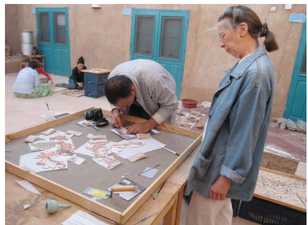
During adhering and physical reconstruction of various parts of the Putto: B. Gahad and