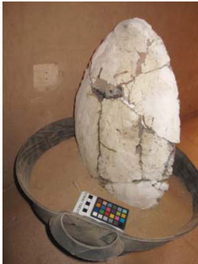
Supporting the lid in a sandbox during setting of the adhesive.