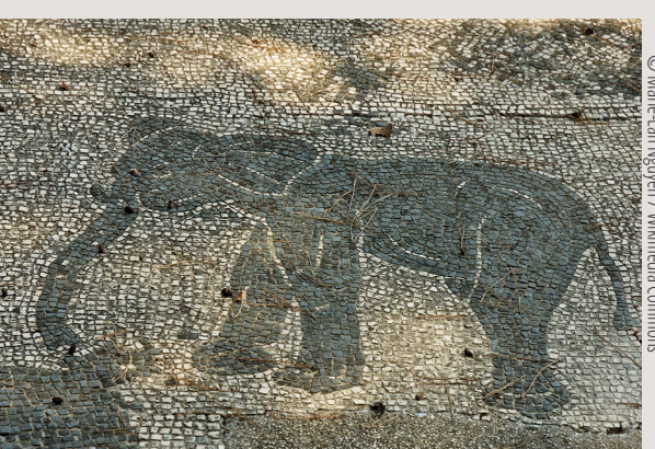
Mosaic with an elephant. Part of Statio 14 (for Sabratha office) of the Piazzale delle Corporazioni, Ostia Antica, Latium, Italy

My current research is focused on the practices, attitudes, and agendas required for and revealed by the activity of dissection as practiced by Galen, those around him, and those who followed him. Not only did doctors attend the public dissection of animals, nonmedical individuals of various stripes could also be found there. He