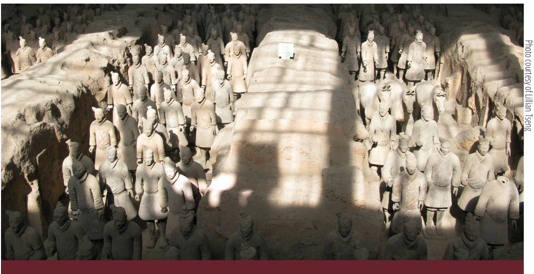
Detail of Pit 1, Mausoleum of the First Emperor, Lintong, China

miles east of Xi'an, China, in the summer of 2015. We took advantage of the permanent exhibitions that resulted from on-site preservation, including the renowned three pits of terracotta warriors and the lately acclaimed pit of entertainers. We also benefited from a special exhibition that featured many precious painted figurines, which gave us better ideas of how colors were used. We enjoyed the privilege of closely inspecting the figurines under conservation in Pit 1 and Pit K9901. Through extensive discussions with local archaeologists, we learned firsthand the on-going excavations and the updated understanding of the environment, the domain, and the structure of the mausoleum. Armed with the substantial observation and new knowledge from the field, the team will share preliminary thoughts in a workshop at NYU-Shanghai in 2016.