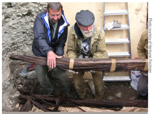
Excavation of a Scythian "Ice Mummy", Summer 2006, Mongolian Altay

During the first millennium BCE, the cultures in the Eurasian steppe belt went through a deep transformation. From the 8th/7th century BCE on, nomadic tribes emerged throughout that region. We know them as Scythian or Sakas, but it is hardly possible to identify archaeological materials with concrete names of tribes. Significant changes in the economy, in the way of living and fighting, but also in the arts and the social structure, are typical for these early nomadic groups between the river Yenisei in the east and the lower Danube in the west. The social structure of Scythians and other groups in the Eurasian steppe is mainly reflected by their graves, burial mounds, which are called "kurgans." There are monumental kurgans with rich inventories, including golden objects and imports, and Herodotus