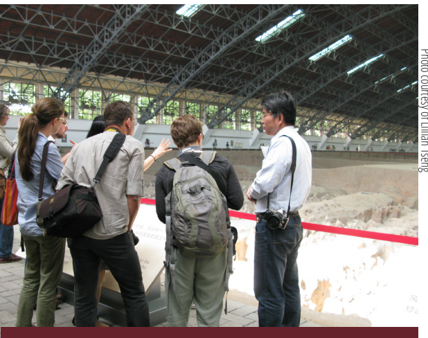
The ISAW team at Pit 1

The project began with an on-site workshop in the Museum of the Mausoleum of the First Emperor at Lintong, approximately twenty