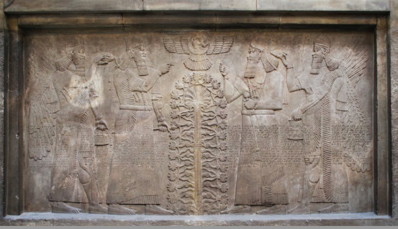
all Relief from the Throne Room in Ashurnasirpal II's Northwest Palace at Nimru showing the combination of text and image. (British Museum: 124531)

blocks of cultural memory with the image activating memories of more extensive narratives. Matthew Waters addressed the transcultural perspectives of text and image discussing the adaptation of Assyrian tropes to shape the image of the "divine king" in the verbal and the pictorial repertoire of the Old Persian kings. Natalie May focused on the aspect of drawing being part of the scholarly training