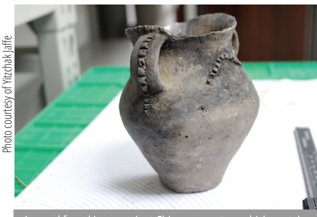
A vessel found in an ancient Chinese cemetery which contains

In some cases the scientific process of cooking actually helped the scholars involved understand the history better. The team working on Babylonian recipes encountered some that were only a few sentences long. A situation like this poses all kinds of methodological guestions for the chefs: can we be sure that we know what the listed ingredients actually are?