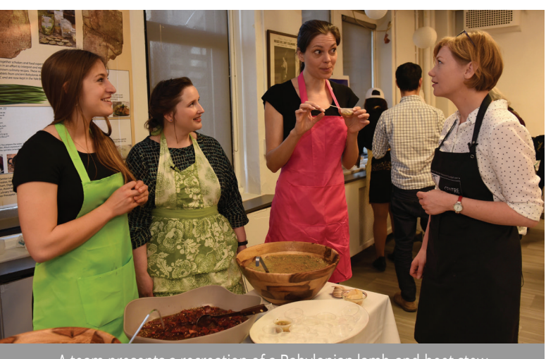
A team presents a recreation of a Babylonian lamb-and-beet stew

Food and food habits are a key marker of identity. It defines where, how, and what you eat, which, in turn, determines when and with whom you can socialize. At the same time, historically speaking, when we come into contact with other groups it is often the other group's