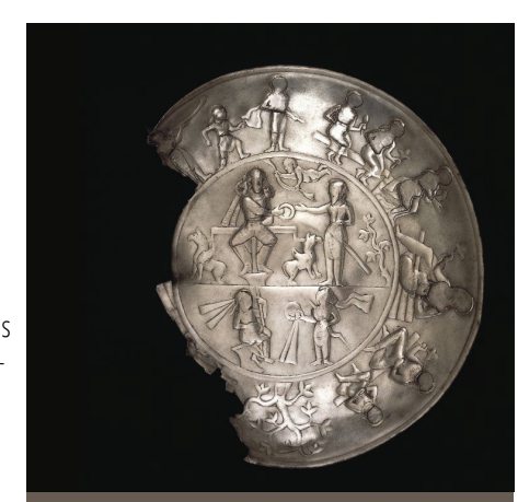
Fragmentary Silver Plate (British Museum, acquired in Rawalpindi, 4th century?)

Late Antiquity in Western Central Asia and Eastern Iran—that is the centuries between the downfall of the Great Kushan dynasty and the beginning of Türk suzerainty—remains a particularly obscure period. Major questions concerning even basic political and cultural developments are still poorly understood. Yet, it is clear that this period was one of important and momentous political, social, demographic, and cultural change—such as the rise of Iran as a new hegemonic power in the wider region, the ascent of Sogdiana as one of the main cultural and economic power-houses of Eurasia, and the influx of new populations and elites, labeling themselves and/or labeled by others as "Huns." One of the major problems faced by any historian of Late Antique Central Asia and Eastern Iran is the dearth of historiographical (narrative) sources. All the more important are numismatic, epigraphical, and archaeological data, which have in recent years greatly improved our overall knowledge of the area during this supposed "dark age." Yet, each of these disciplines has its own methodological, terminological, and