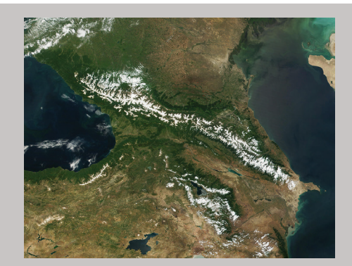
Caucasus mountains, Black Sea, and Caspian Sea

An Introduction to Roman History (in Chinese). Beijing: Peking University Press, 2014.