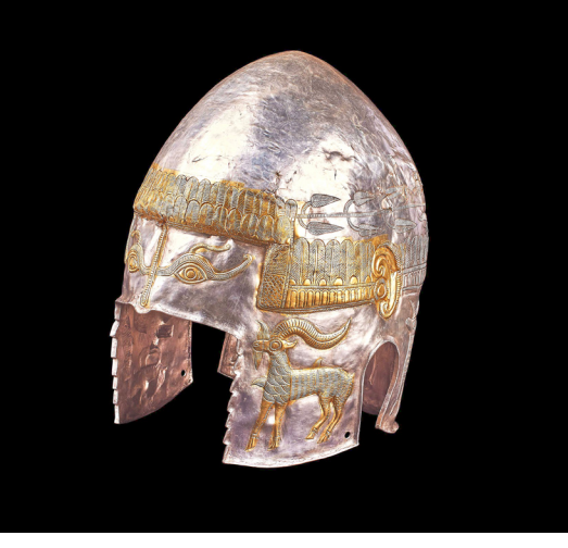
Helmet, Peretu, Romania, 325-275 BCE, silver gilt, 10½ inches high. National History Museum of Romania, Bucharest, Romania.