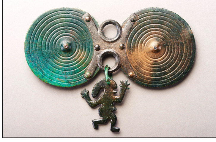
Fibula, Vicinity of Gracac, Croatia, 500-300 BCE, bronze, 6½ inches long. Archaeological Museum in Zagreb, Zagreb, Croatia.

the Ancient World at New York University is at 15 East 84th Street. For information, 212-992-7800 or www.isaw.nyu.edu.