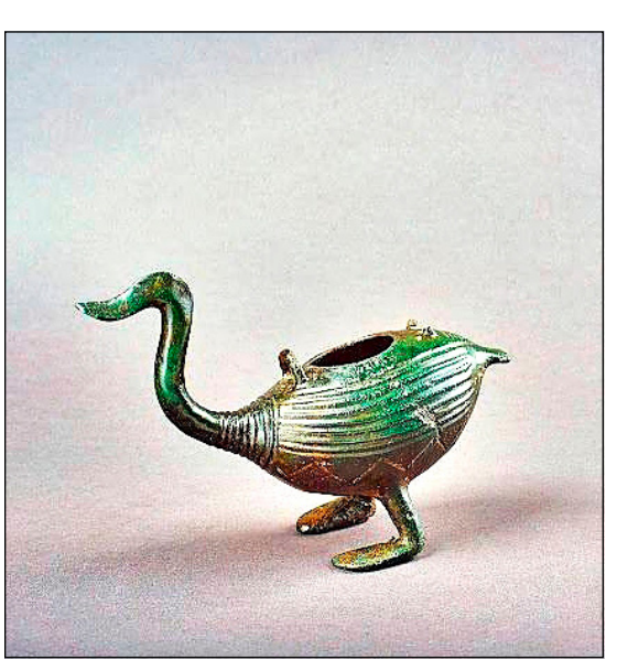
Bird-shaped lamp, 1200-900 BCE, bronze, 4<sup>3</sup>/<sub>4</sub> inches high. Hungarian National Museum, Budapest, Hungary.