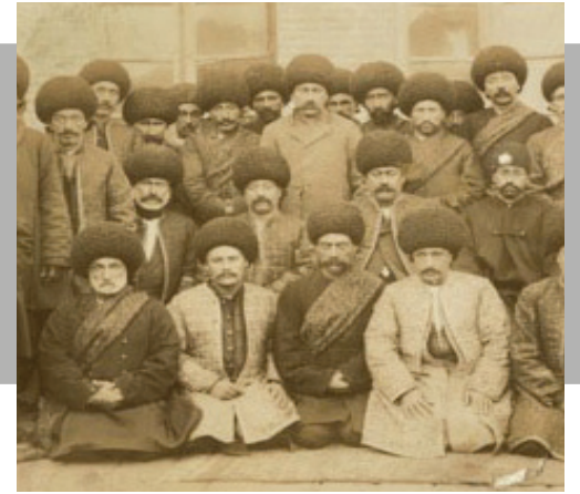
Shahsevan chiefs and tribesmen, by Morgan Phillips Price, 1912; courtesy Royal Geographical Society with the Institute of British Geographers

Western travellers estimated that no less than half of Iran's population was nomadic. And when archaeologists began to pay attention to Iranian nomads in the mid- to late-twentieth century, they assumed these groups had always been where they then were, had always lived as they then lived, and completely ignored both the background of their arrival, and the vicissitudes they had undergone in the twentieth century — forced sedentarization, mandatory schooling, increasing production for the market, altered migration routes due to the loss of their former grazing lands at the hands of the government, and the list goes on. Nomadism in Iran has a long, varied and fascinating history, but it is not an organic development, an integral part of Iranian prehistory prior to the first millennium BC, when Herodotus first wrote of Persian nomadic tribes.